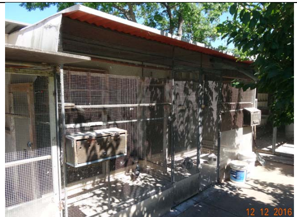
GENERAL VIEW OF THE LOFT