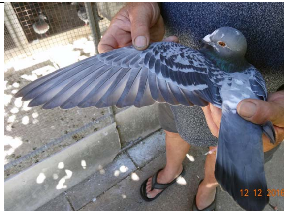
THE WINNING WING

Absolutely some birds are smarter than others and some birds although regularly on the track don't seem to be bothered with hawks. We should be breeding more of these!