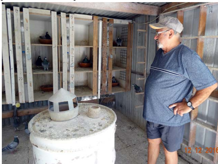
THE STOCK HOUSE

I have put birds bred for stock in the stockhouse but the criteria is the same – they must produce. If a bird performs on the road and in the stockhouse what more do you want. This